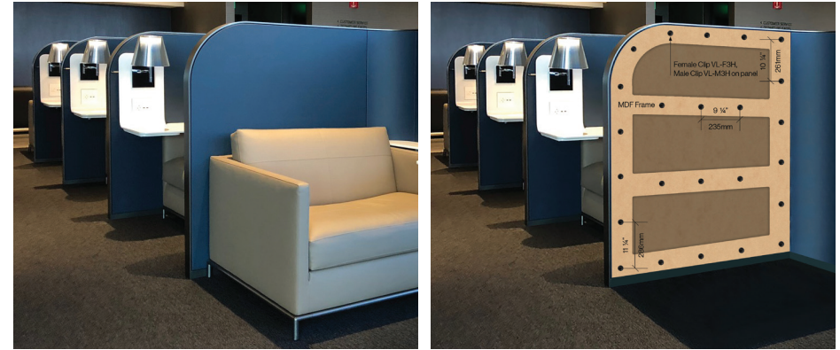
Panel mounting solution: VL-F3H - substrate & VL-M3H - panel

Differentiate your product by extending its lifetime and making it more sustainable. Fastmount connectors allow easy retrofit, upgrade, and cleaning and replacement of components.