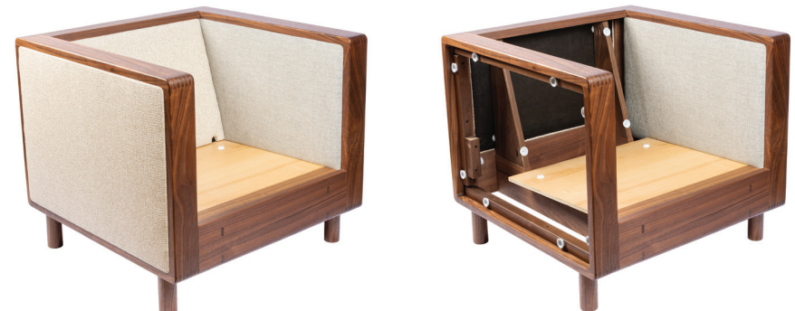
Panel mounting solution: VL-F3 - substrate & VL-M3 - panel

Design furniture that can be easily reconfigured, or adapted to changing needs with hidden connectors that ensure perfect positioning every time.