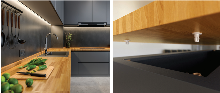
Panel mounting solution: PC-VM1 - substrate & PC-RF1 - panel

Streamline your manufacturing using Fastmount connectors and CNC machinery, or Fastmount Center points, while improving precision and simplifying installation.