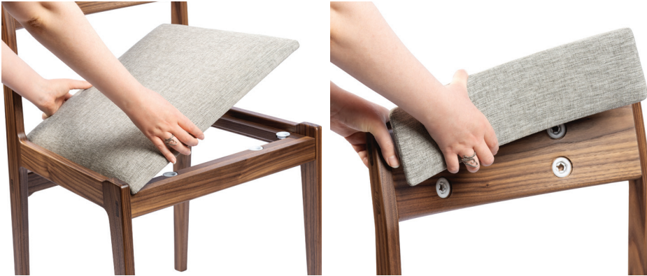
Panel mounting solution: VL-F3 - substrate & VL-M3 - panel

Transform furniture designs with upholstered elements that attach precisely and securely yet can be removed and reattached multiple times.