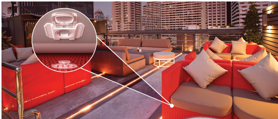
Textile mounting solution: TC-M6 - substrate & TC-F6H - textile

Secure cushions and upholstered elements to furniture frames preventing shifting while allowing for easy removal and cleaning.