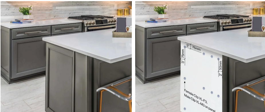
Panel mounting solution: VL-F3 - substrate & VL-M3 - panel

Create seamless connections between end panels and cabinet bodies maintaining clean lines. Allows easy installation in the field, avoiding damages in the transportation and allowing easy replacement in case of damages.