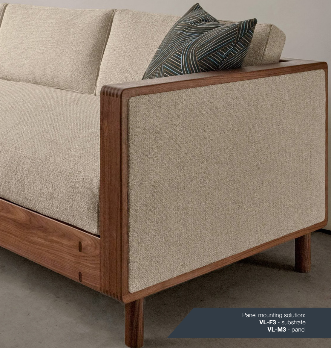
Panel mounting solution: VL-F3 - substrate VL-M3 - panel