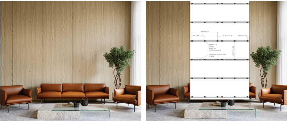
Panel mounting solution: SL-FB1 & SLRLE - substrate & SL-M18 - panel

Easy and secure installation method, easily installed in irregular walls and surfaces while keeping perfect panel alignment.