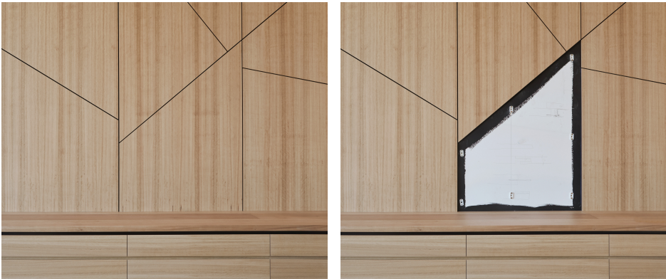
Panel mounting solution: PC-SF1 - substrate & PC-M2H - panel

Precise alignment for intricate architectural designs with hidden fastening.