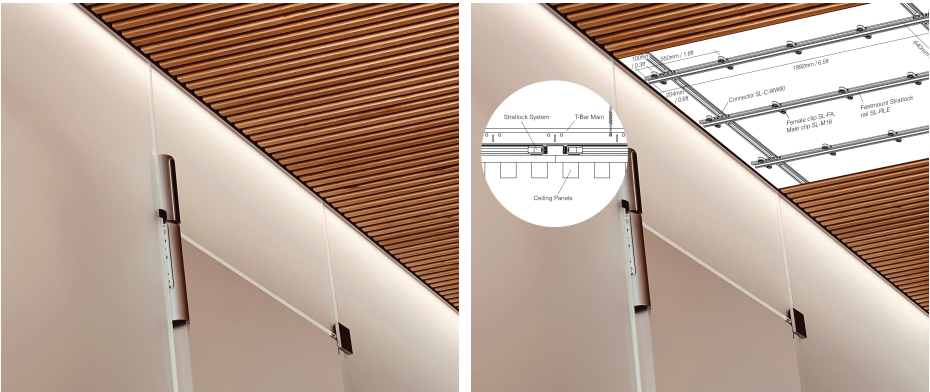
Panel mounting solution: SL-FA, SL-C-WW90 & SL-RLE - substrate & SL-M18 - panel

Fastmount's proprietary rail system allows preassembly offsite, reducing installation time. It enables easy removal of ceiling panels for access of ceiling void for maintenance of electrical wiring, plumbing, HVAC ducts, and other infrastructure elements, while holding panels securely. Our Panelsafe system is also available for extra safety.