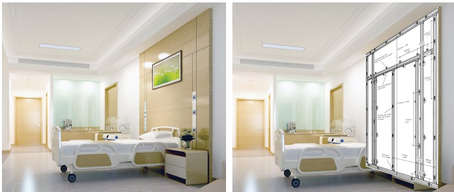
Panel mounting solution: SL-FB1, SL-RLE & SL-WW90 - substrate & SL-M10 - panel

Create standoff walls, enabling easy access to behind panels service systems. Ideal for patient headwall units.