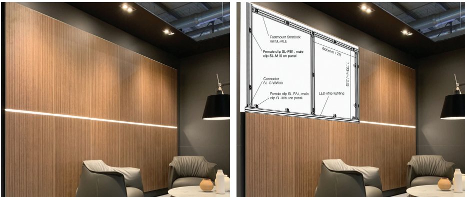
Panel mounting solution: SL-FB1, SL-C-WW90 & SL-RLE - substrate & SL-M10 - panel

Transform spaces with perfectly aligned decorative elements, including integration of LED lights and precise panel gap control.