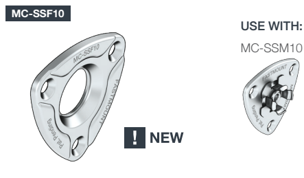
MATERIAL: 304 Stainless Steel 301 Stainless Steel (spring component)

The MC-SSF10 is built from 304 stainless steel for enhanced fire safety and durability. As well as offering superior fire resistance, the clip can withstand heavy load bearing for both wall and ceiling panels. The clip is screw fixed to the substrate before the male clip component is connected. Ideal for use with fire-rated panels, in fire egress paths and anywhere fire-rated certification is required. Refer to Panel Offset Guide for gap between substrate and panel, pull out and shear loads.