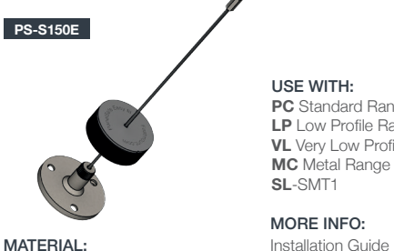
Silver Aluminum/stainless steel

PanelSafe Easy Fit restraint systems provide added security and control. The panel is suspended below the ceiling for convenient servicing behind the panel or controlled removal of the panel by releasing the wire. For use with Fastmount system clips and installation tools. The PS-S150E is for use with substrates with a cavity behind that can accommodate the sprina.