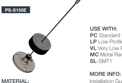
Silver Aluminium/stainless steel

PanelSafe Easy Fit restraint systems provide added security and control. The panel is suspended below the ceiling for convenient servicing behind the panel or controlled removal of the panel by releasing the wire. For use with Fastmount system clips and installation tools. The PS-S150E is for use with substrates with a cavity behind that can accommodate the sprina.